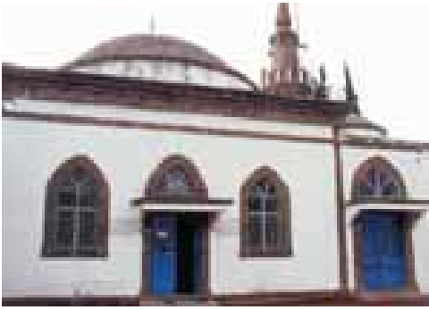
Ahi Evran Dede Mosque