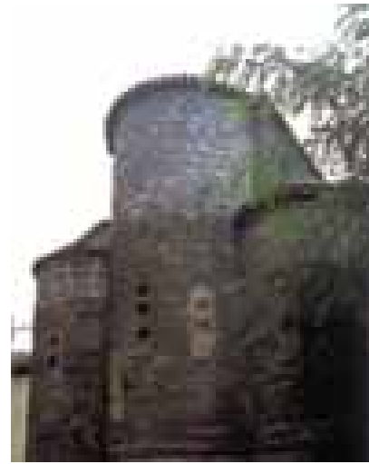
St. Anna Church